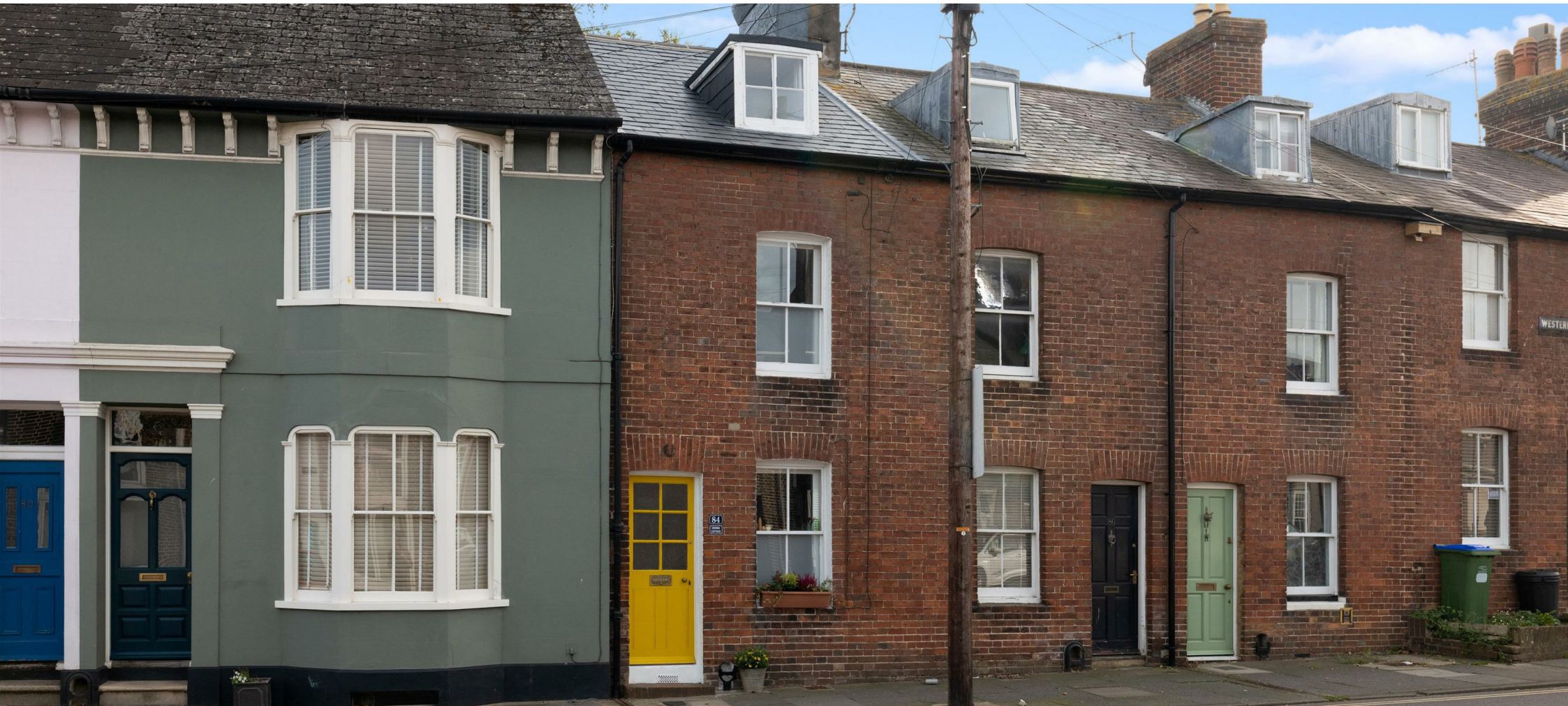
Western Road, Lewes